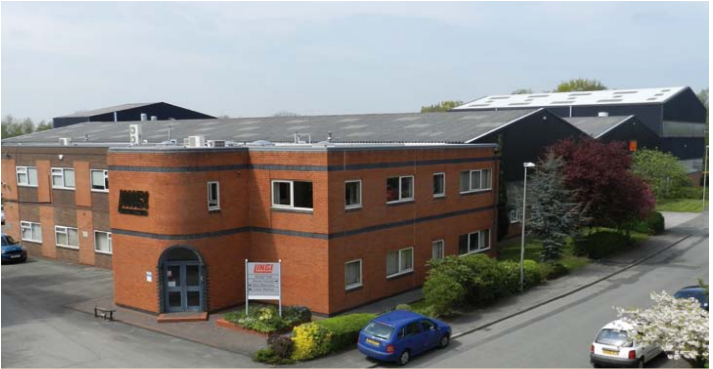
Aerial View of Lingl LUK Premises