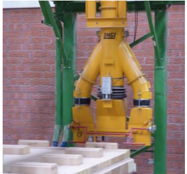
Suction Nozzle for Roof Tile Production