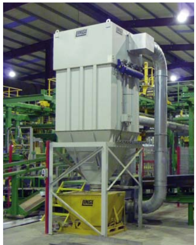
Cyclone Suction Filter