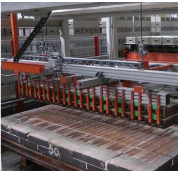
Lifting Device for Draft Blocks