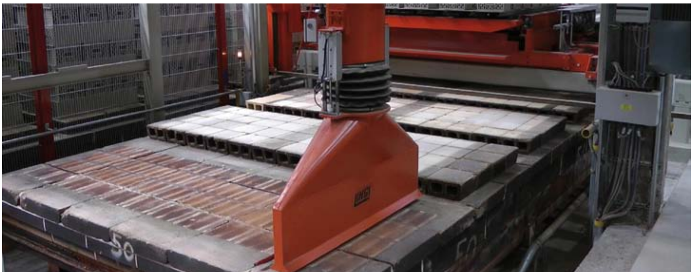
Suction Nozzle for Brick Production