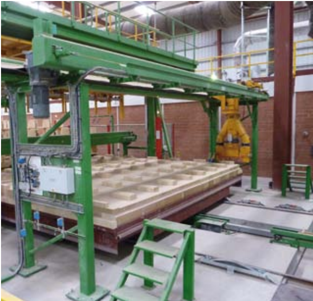
Machine for Roof Tile Production